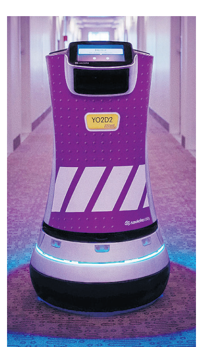
Yotel Boston's robot butler, named Yo2D2, will deliver items to your cabin.

The technology: Yotel's advanced tech appeals to travellers on the go. It's a bit of a do-it-yourself visit. You can save time with a self-check-in at a kiosk, similar